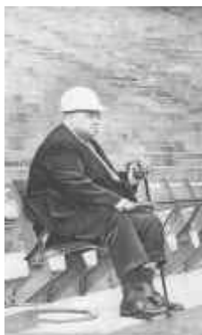
H. Roe Bartle, sitting at unfinished Arrowhead.

The Dallas Texans celebrated after they won the AFL title in 1962, and Kansas City celebrated after Lamar Hunt (right) moved the franchise here.